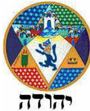
SEAL OF THE TRIBE OF JUDAH

The scope of the choir is to reach out to the community by including anyone interested in participating. The