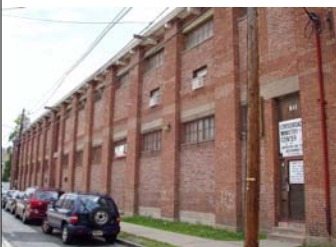
MINISTRY CENTER— Madison Avenue Crossroads Community Ministries, Inc.

For the past 15 years, the Madison Avenue Crossroads Community Ministries (MACCM), the service arm of the Madison Avenue Christian Reformed Church, has occupied (rented) the 2nd floor of the industrial building at 511 East 22 nd Street as a Ministry Center. After making many overtures to acquire the building over the years, the owner, Mr.